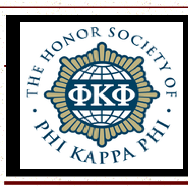
Upcoming Events:Forum Speaker11/12/09PKP Essay Contest Deadline12/15/09Deadline for Paying PKP Dues12/31/09Initiation Banquet2/10/09PKP Service Project/Mix & Mingle2/27/09Scholarship Application DeadlinesVary (see p. 2)Award Application DeadlinesVary (see p. 2)