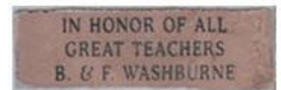
Sample Commemorative Bricks